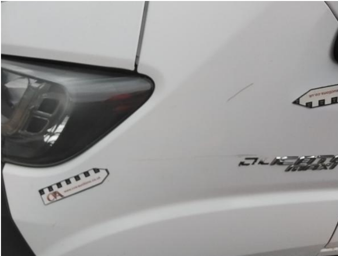
3: Wing nsf Scratched Over 25mm Thru Paint