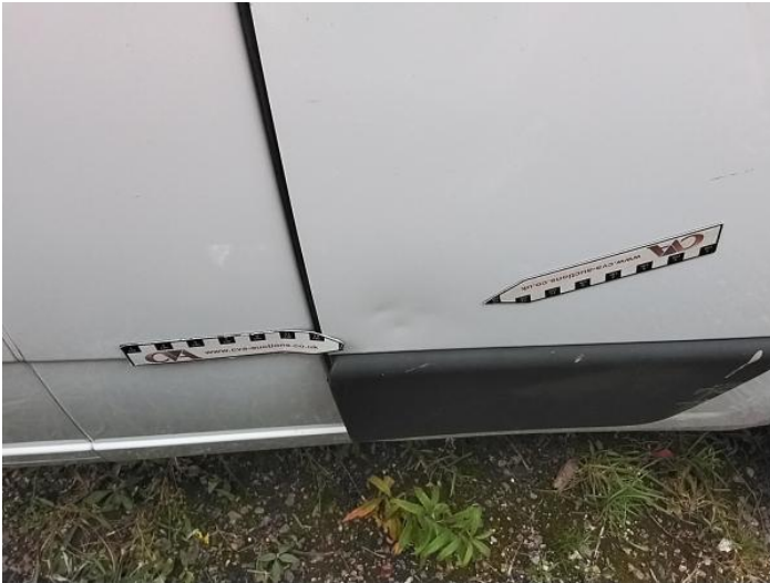
9: Door osf Dented Over 30mm