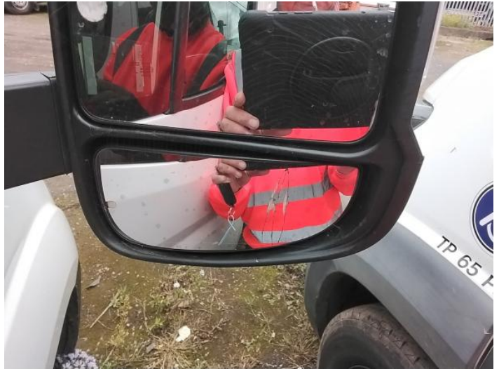
10: Door Mirror Glass os Broken Replace