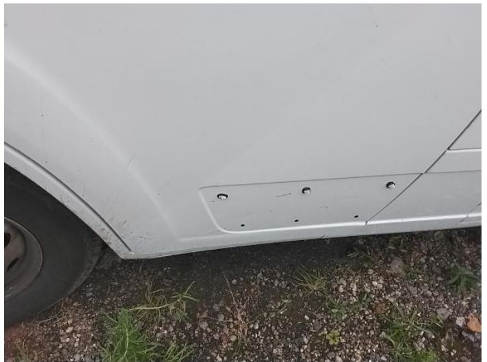
6: Door Moulding nsf Missing Replace