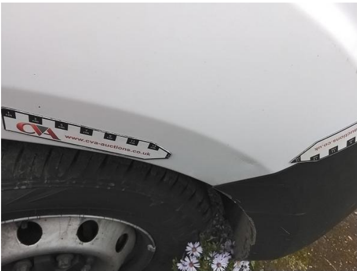
11: Wing osf Dented With Paint Damage