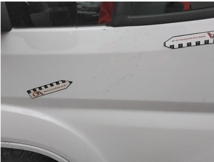
5: Door nsf Scratched Over 25mm Thru Paint