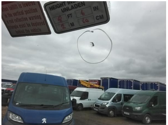
12: Screen Front Chipped Over 10mm