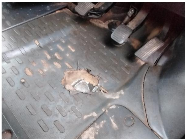
14: Carpets Front Holed Over 3mm