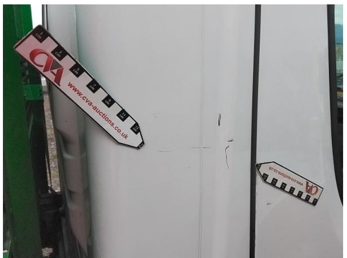
8: B Post os Scratched Over 25mm Thru Paint