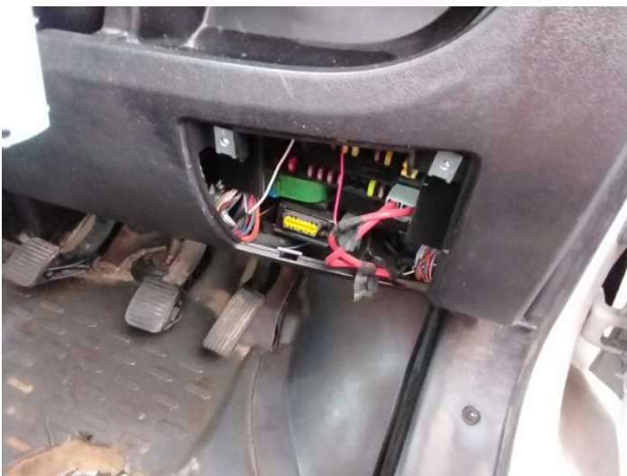
13: Fascia Panel Missing Replace