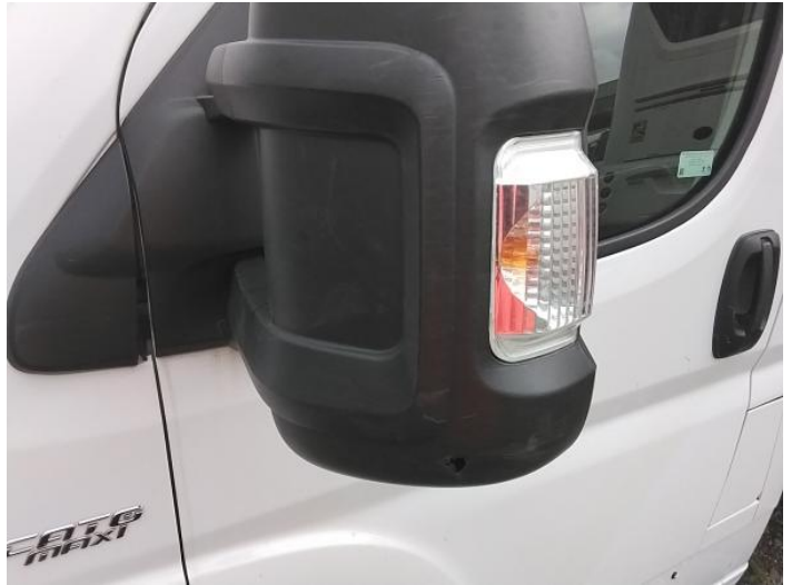
4: Door Mirror Assy nsf Broken Replace