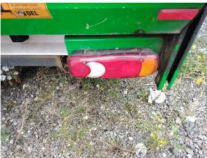
7: Lamp osr Broken Replace